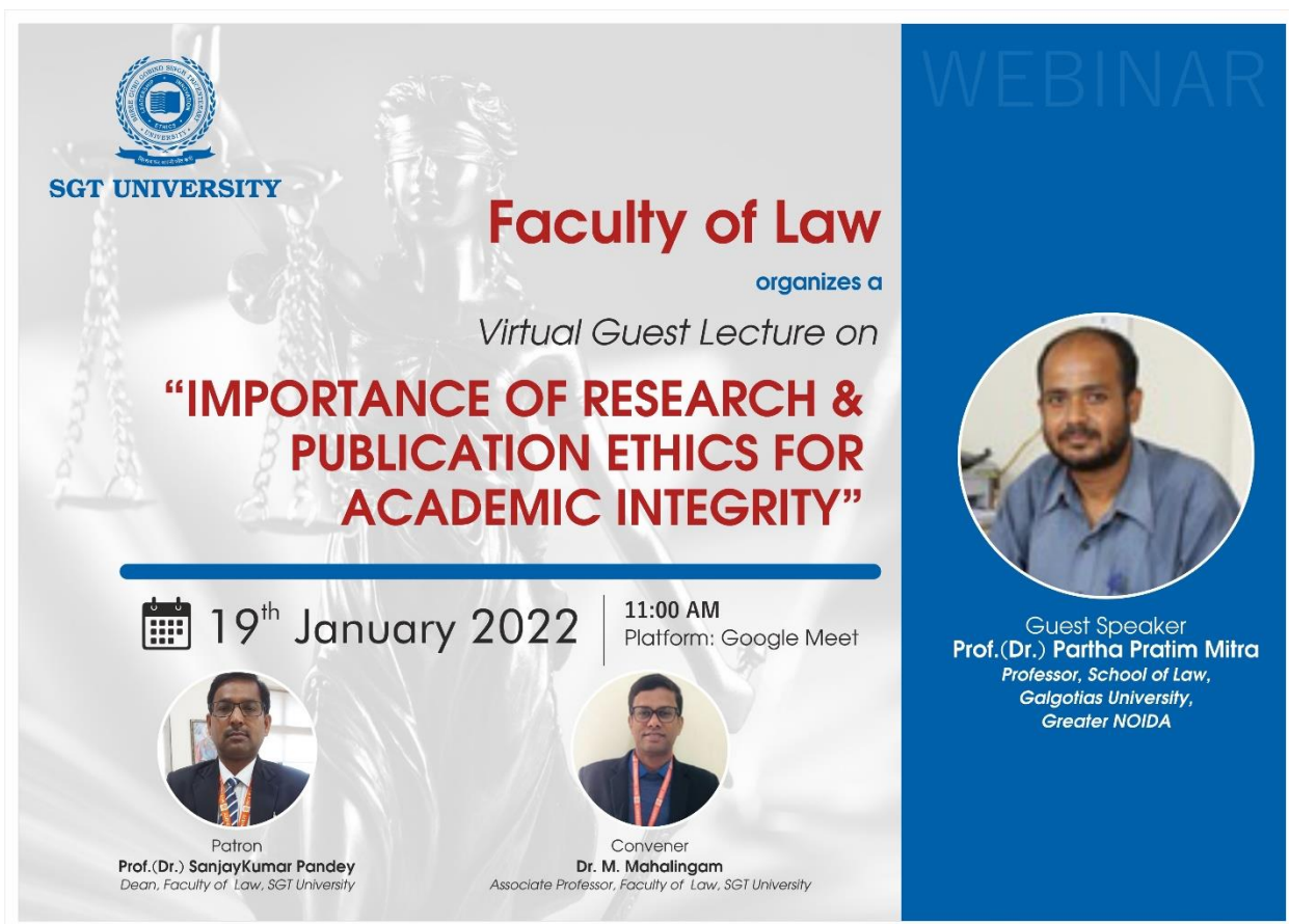
Figure: 01 E- Banner of the Event

Budhera, Gurugram-Badli Road, Gurugram (Haryana) – 122505 Ph. : 0124-2278183, 2278184, 2278185